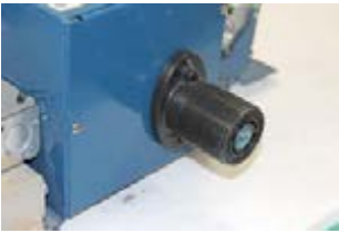
2) Open existing housing to remove fiber port