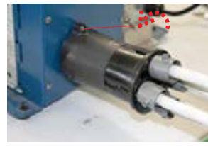
1) Unscrew existing harness