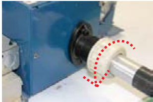
1) Unscrew existing harness