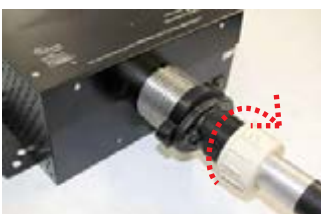
10) Screw on new fiber harness. (NOTE: It may be necessary to hold part to avoid twisting off)