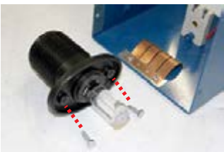
4) Re-thread screws into fiber port