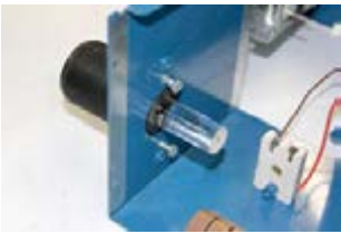
3) Remove 2 screws inside unit securing fiber port