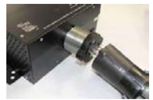
2) Re-attach fiber harness to new unit