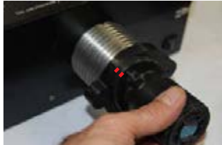
8) Align screw heads with slotted holes