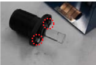
5) Do not tighten all the way. leave appx. 13/16" gap