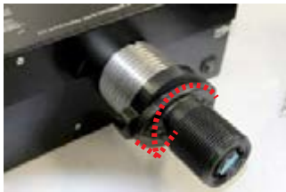
9) Twist fiber port counter clockwise until tight