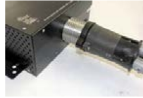
3) Align the two screw holes