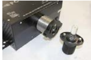
6) Reattach existing fiber port to new unit