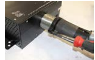
4) Screw and tighten with existing screws